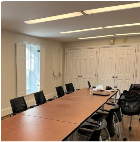
Dawson Terrace Conference Room, available for NHCA Committee meetings.